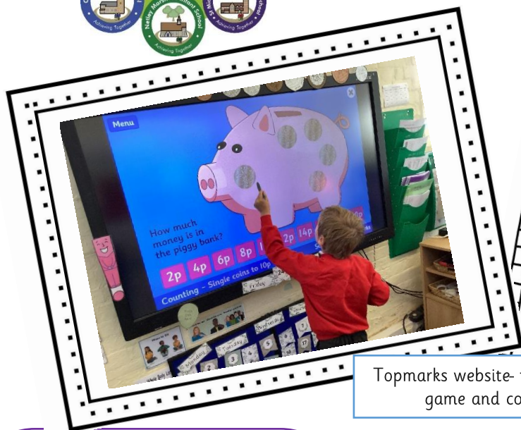
Topmarks website- toy shop money game and coins game